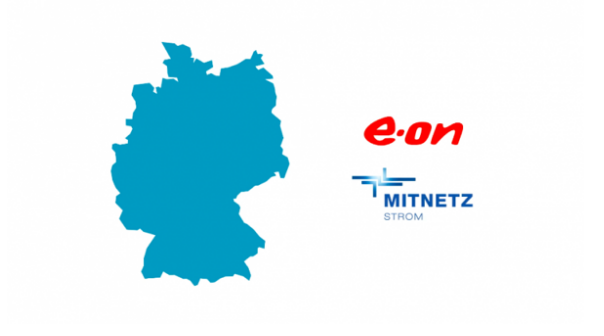
VIDEO I German EU-SysFlex Demonstrator

FEBRUARY 2021 I INTERRFACE project organized its first Flexibility Solutions webinar on 25 February 2021 and EU-SysFlex has been invited to present the project developments in a H2020 project session.